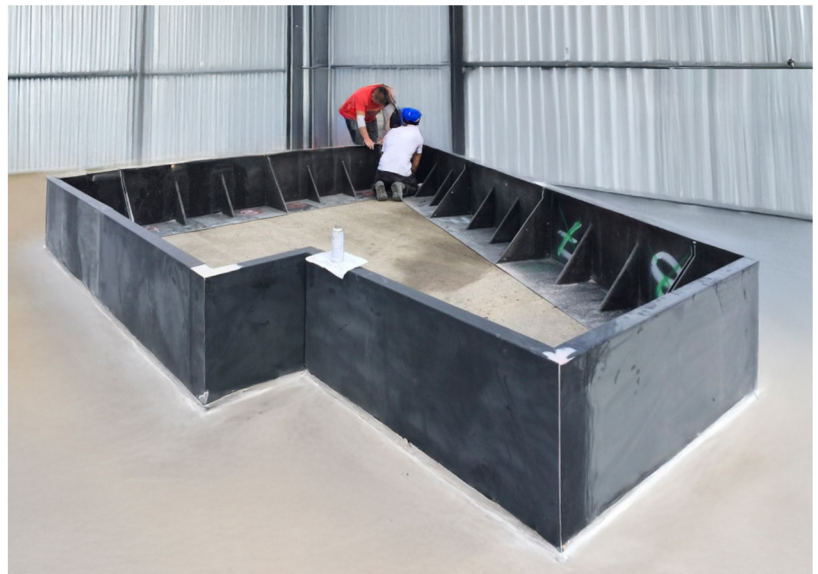
Planter pre-assembled at the factory, as drill holes are made to ensure accuracy

Once panels are fixed together on site, planting up may begin. We may recommend some additional GRP strips bolted between opposite faces to keep overall shape.