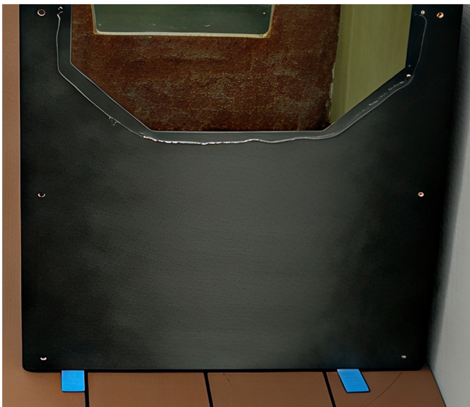
Planter module with sili-cone applied ready for bolting of next module